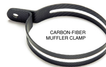
CARBON-FIBER MUFFLER CLAMP