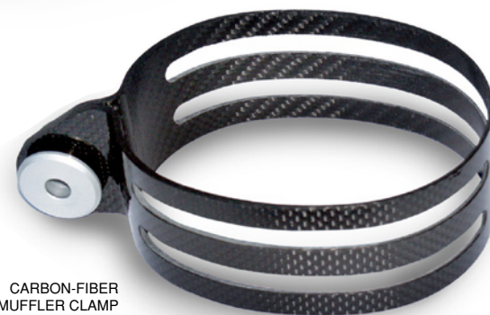
CARBON-FIBER MUFFLER CLAMP

Product code: 105489 (S-B12SO3-LTC) 105488 (S-B12SO3-LTT)