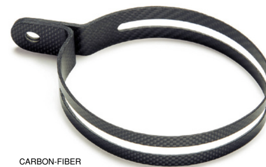
CARBON-FIBER MUFFLER CLAMP