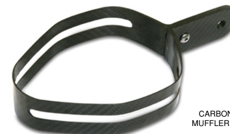
CARBON-FIBER MUFFLER CLAMP