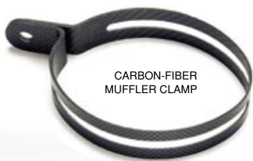
CARBON-FIBER MUFFLER CLAMP

Akrapovic Exhaust System Technology copyright 2004, all rights reserved