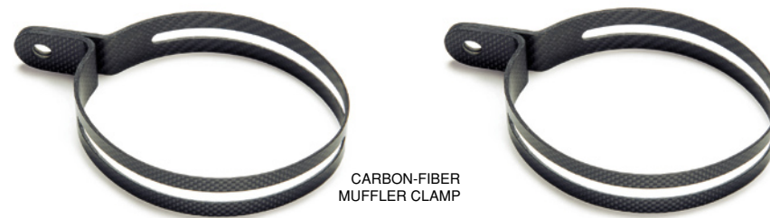
CARBON-FIBER MUFFLER CLAMP

Product code: 106417 (SS-K14S01-T) 106418 (SS-K14S01-C)