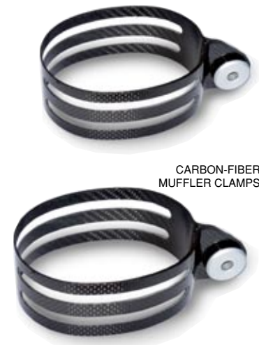
CARBON-FIBER MUFFLER CLAMPS